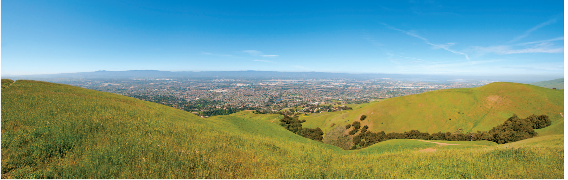
Views from the Sierra Vista Open Space Preserve are expansive.

On October 22, the Bay Area Ridge Trail Council will dedicate 5.3 miles of scenic Ridge Trail in the Santa Clara County Open Space Authority's Sierra Vista Open Space Preserve. Located in eastern San José, contiguous to Alum Rock Park, the 1,676-acre ridgeline preserve is the quintessential Bay Area landscape of rolling grassland, oak woodlands, and riparian corridors. With elevations between 1,000 and 2,324 feet, it offers sweeping views of the southern San Francisco Bay and the Santa Cruz and Hamilton mountain ranges.