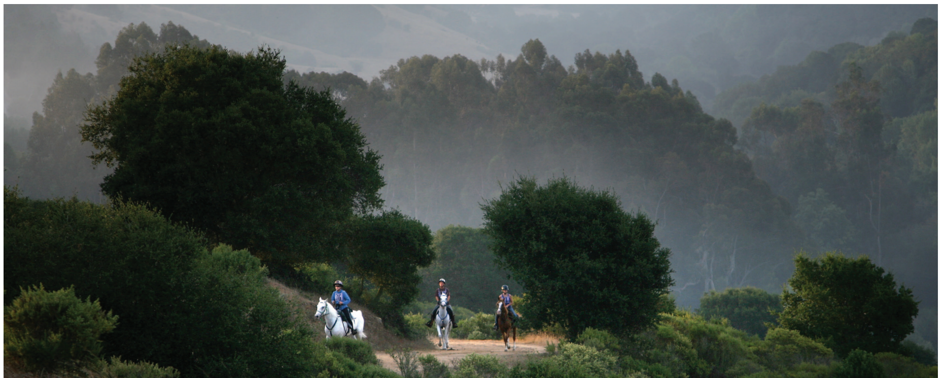
Equestrians on the McDonald Trail, near Bort Meadows, one of the East Bay Hills Benefit Ride and Hike camping sites.

This Labor Day tradition has raised more than $150,000 for the Ridge Trail and other East Bay trails over the past 10 years. Volunteers for Outdoor California provided the kitchen and prepared many of the meals this year. We appreciate the horsemen's associations, the participants, and all the volunteers who made this event possible!