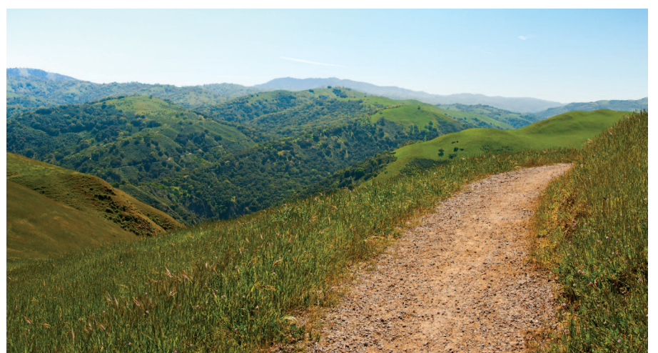
Trail users in the Sierra Vista Open Space Preserve will feel on top of the world.

Over a weekend in June, Volunteers for Outdoor California (V-O-Cal) brought out nearly 100 volunteers to work on the Ridge Trail in 4,020-acre Sugarloaf Ridge State Park. Volunteers, including the Sonoma County Trails Council, repaired a mile-long stretch of trail with severe drainage problems by removing brush, constructing retaining walls, replacing water bars, and building 40 drain dips to help move water off the trail during the rainy season. This section of trail is near a new backcountry campground (also built with help from V-O-Cal) that enables trail users to make multiple day trips on the Ridge Trail. In addition to the 2.7-mile Ridge Trail, Sugarloaf Ridge State Park contains 25 miles of scenic multiuse trails. The Ridge Trail Council is grateful to both V-O-Cal for organizing the work-party weekend and all the volunteers who came out to care for the trail!