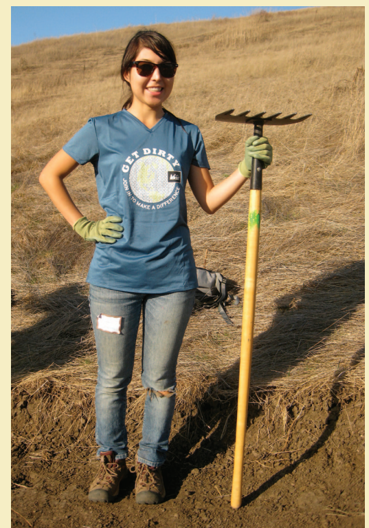
A happy REI-Ridge Trail Service Day volunteer last year at the Pinole Watershed.