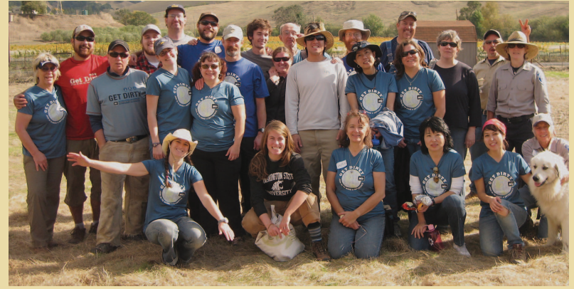
Service Day volunteers at the Pinole Watershed in 2010.