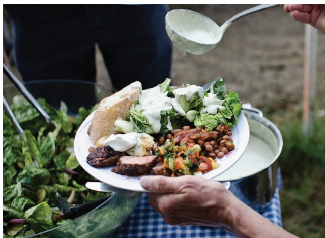
The East Bay Hills Benefit Ride & Hike serves up gourmet food!