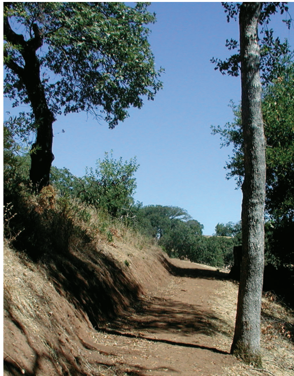
The North Slope Sonoma Mountain Ridge Trail will open next spring.